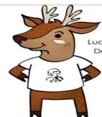
Luc the Deer

We believe every human person is made in the image and likeness of God. This is a gift that we all share as fellow human beings; we are all infinitely loved by our Creator. God is present in every human person, regardless of religion, culture, nationality, orientation or economic standing. Each one of us is unique and beautiful. We are called to treat every person and every creature with loving respect.