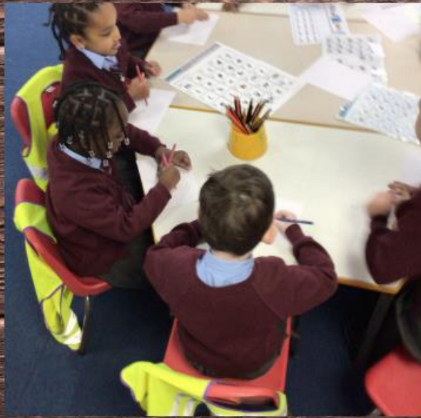
Practicing letter formation, sounds and writing about our story.