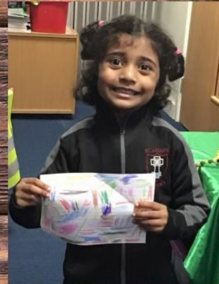
Creating colourful drawings that show a journey like in Rosie's Walk.