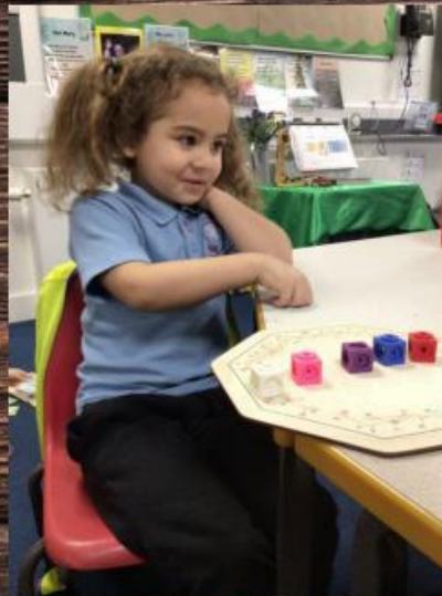
Subitising and counting from 0 to 5.