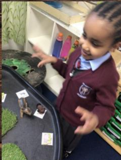
Using language to articulate the animals in a farm.